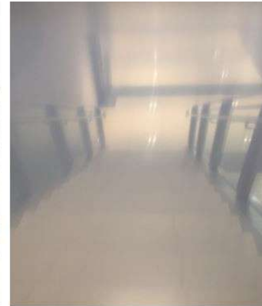
Vision with reduced Contrast Sensitivity